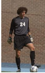
PLAY TOP USA TEAMS