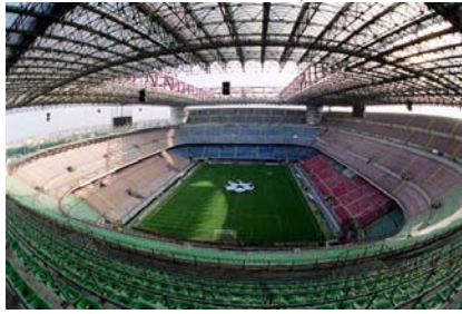
San Siro Stadium, Milan