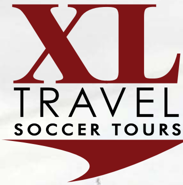
XL AT THE 2006 WORLD CUP